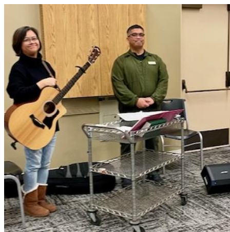
The Choir for the day.