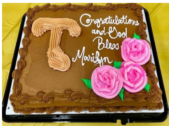
The Cake! Yum!