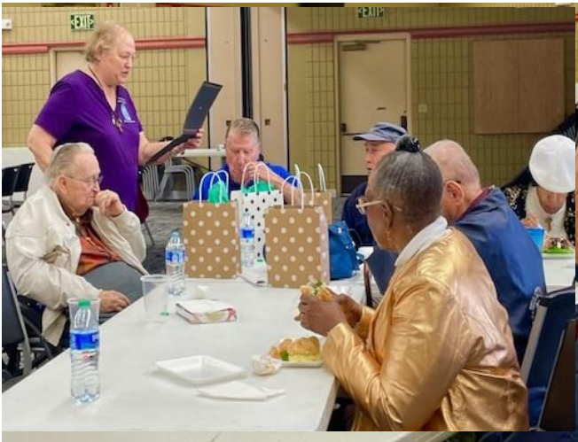
for 60 Years of fine service to the Secular Franciscan Order