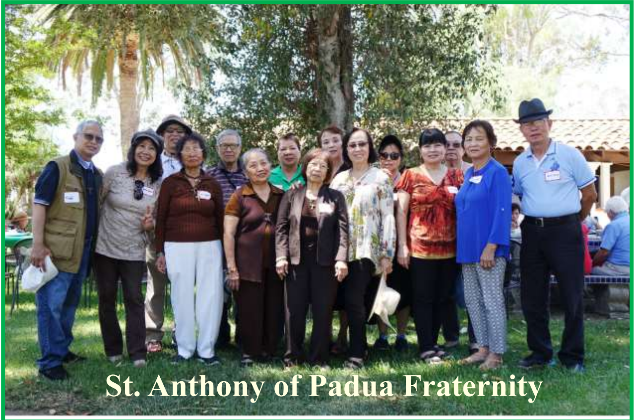
St. Anthony of Padua Fraternity