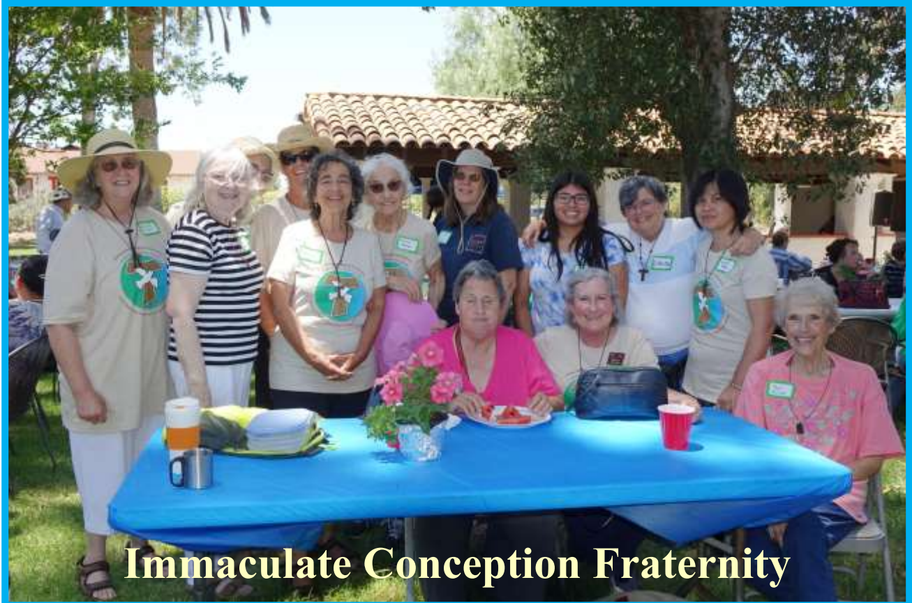
Immaculate Conception Fraternity