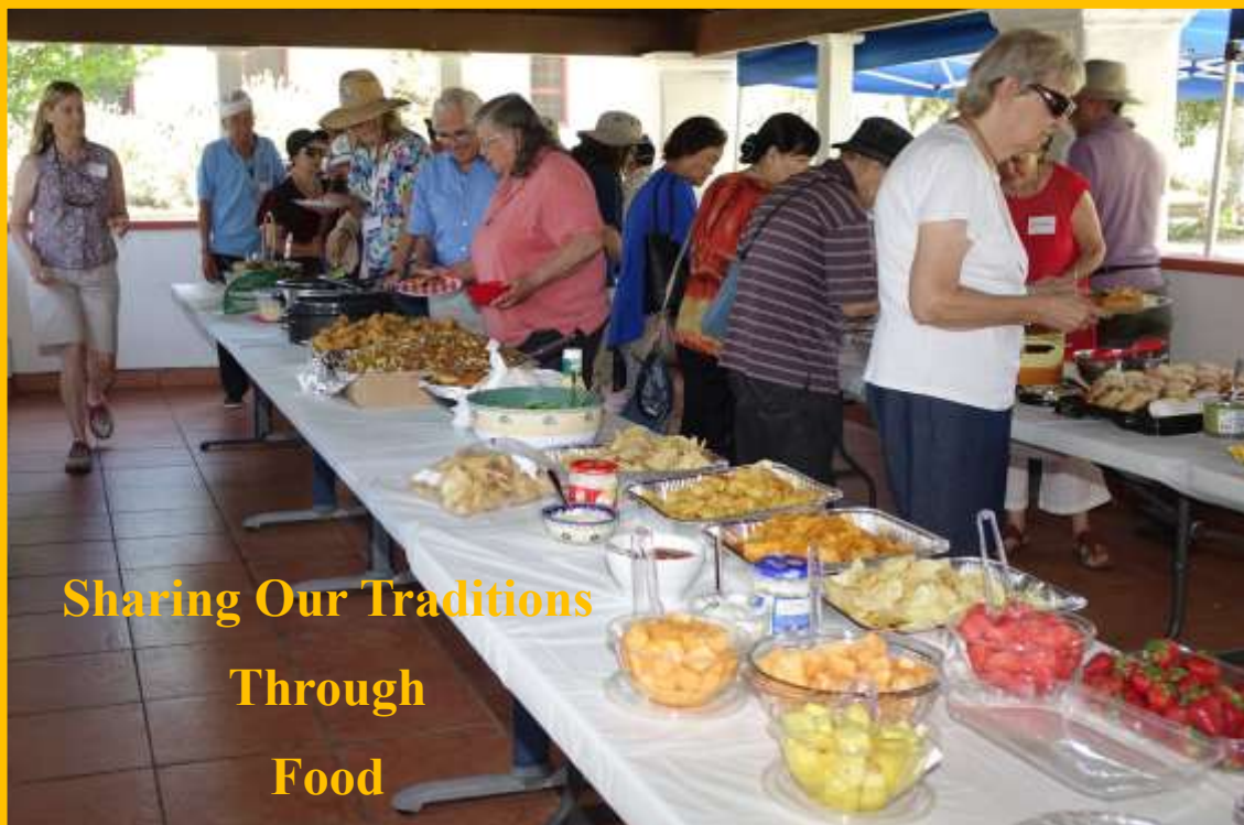
Sharing Our Traditions Through Food