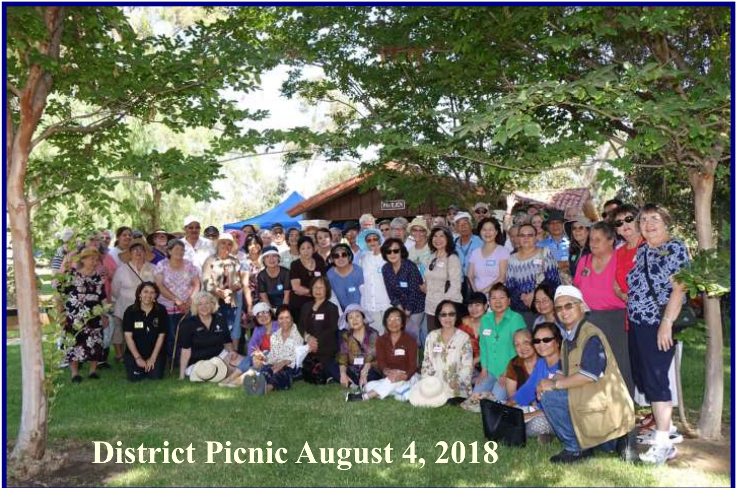
District Picnic August 4, 2018

4/On September 8 th we will have the Regional Gathering at St. Gregory The Great Catholic Community. The address for the location is 11454 Blue Cypress Dr San Diego CA 92131. This time the gathering will be in San Diego and we hope many of our members will attend the event.