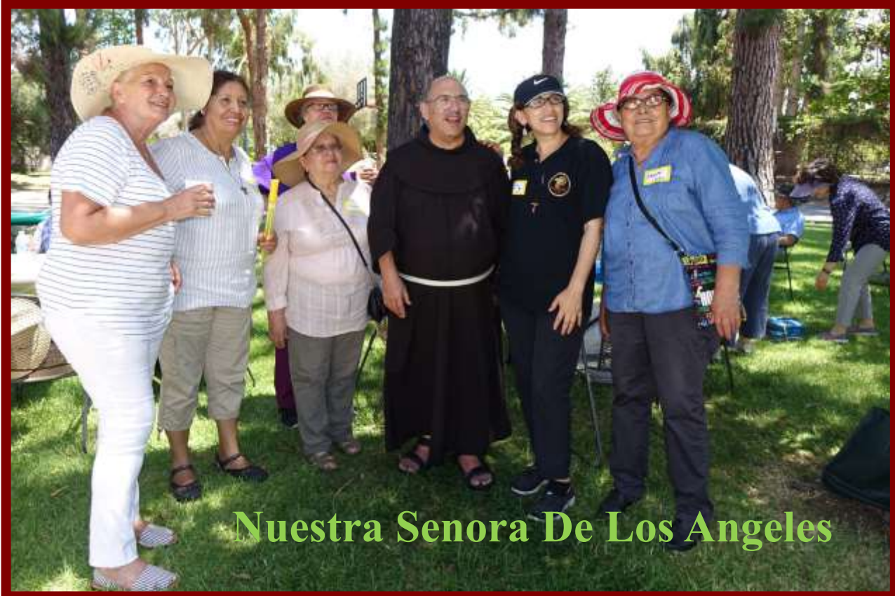
Nuestra Senora De Los Angeles