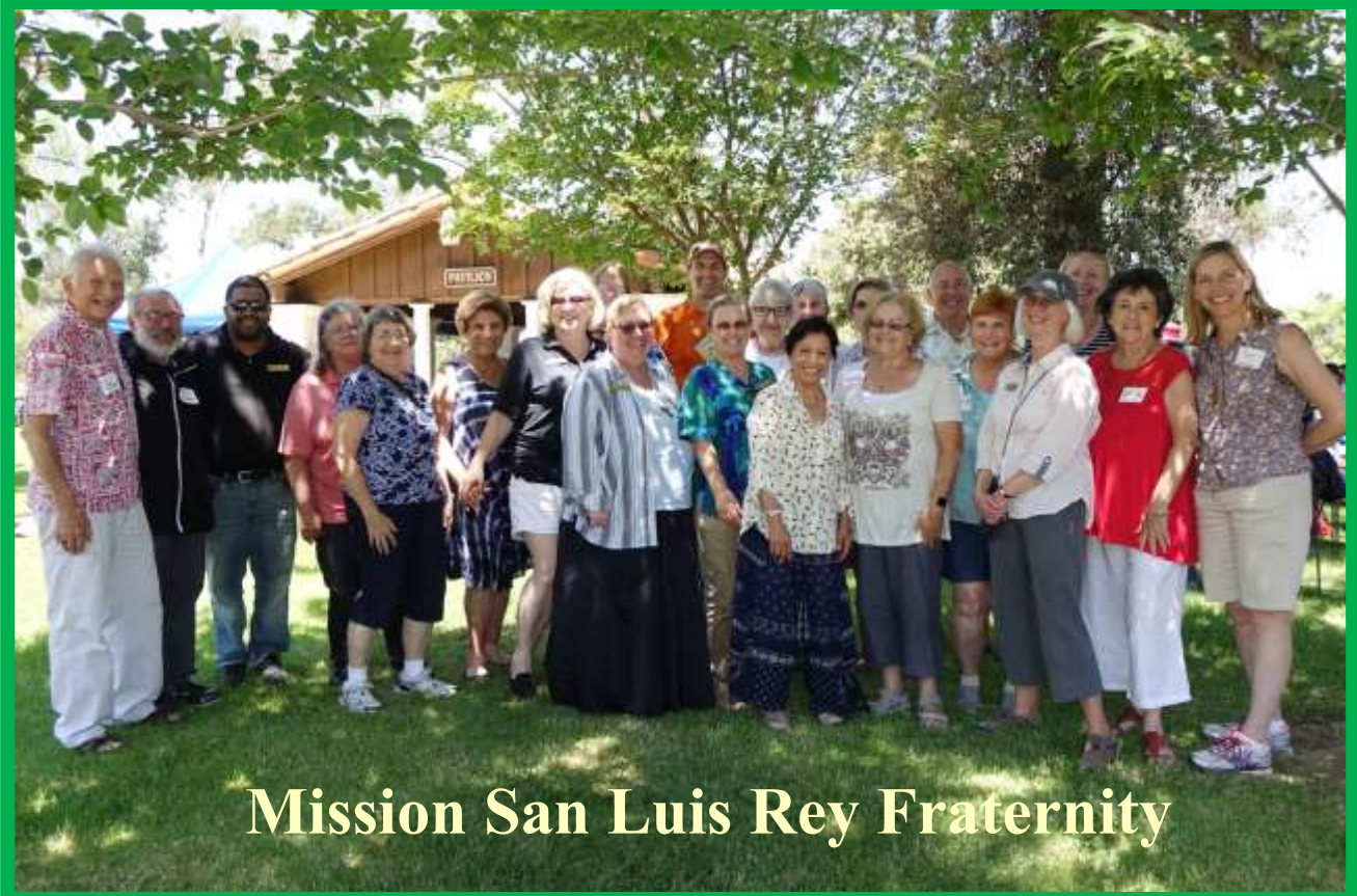
Mission San Luis Rey Fraternity