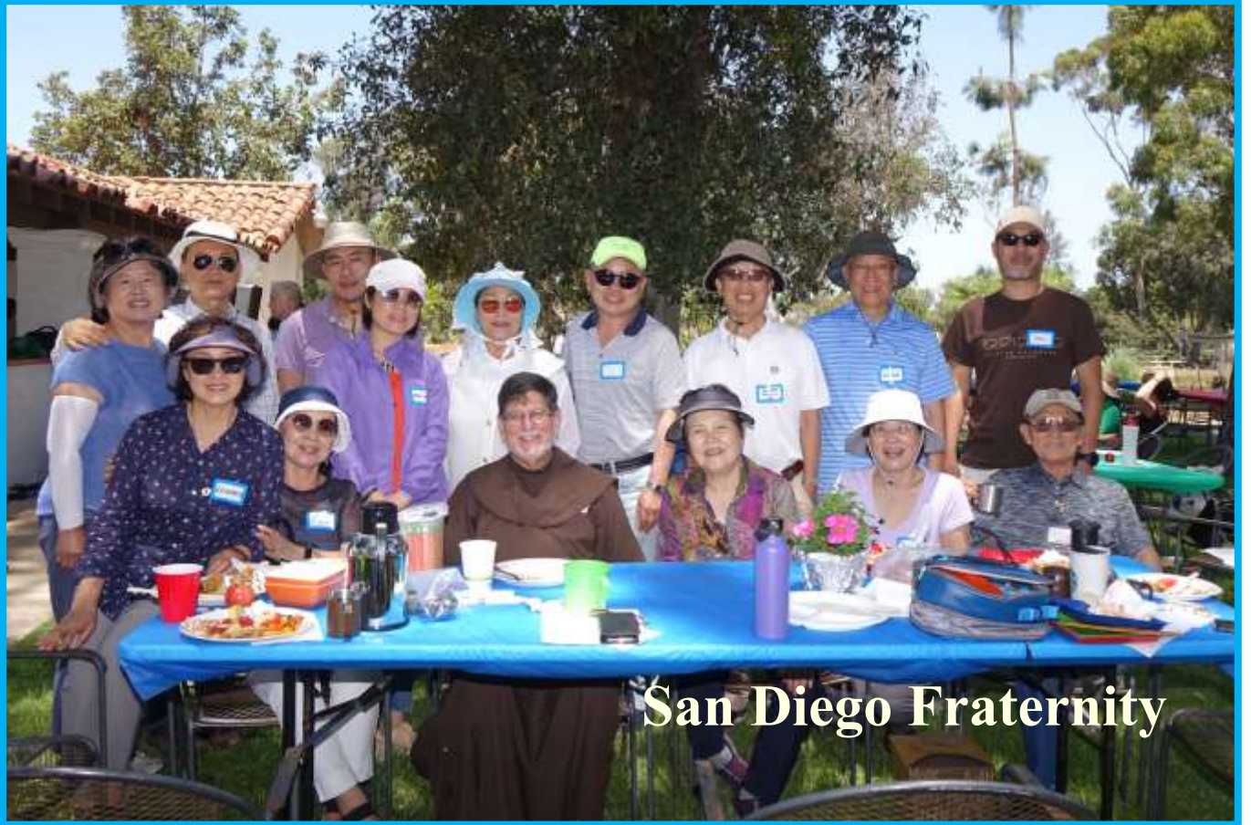
San Diego Fraternity