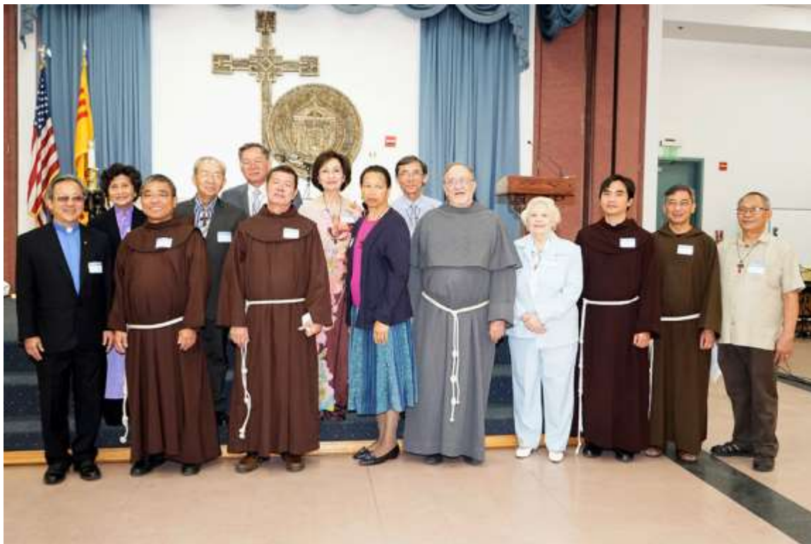
St. Clare's Council and Guests