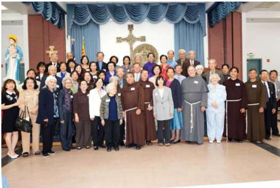
St. Clare's Fraternity and Guests