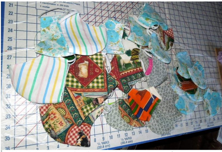
Face masks.

When the order that non-essential staff work from home was given, I was not affected. I have been working from home for over ten years. I could continue my volunteer work.