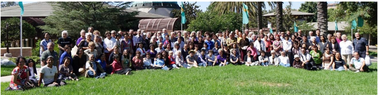
At our Regional Gathering on September 8, 2018 at St Gregory Church in San Diego

Do you remember how St Francis Region celebrated 40 years of our rule?