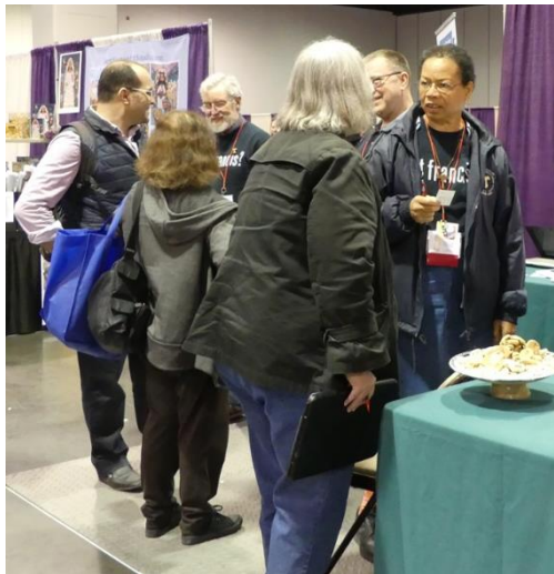
During Religious Education Congress on March 21, 2019, Anaheim Convention Center