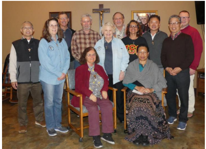
Regional Executive Council Retreat on March 2, 2019 at the Pro Sanctity Retreat Center in Fullerton