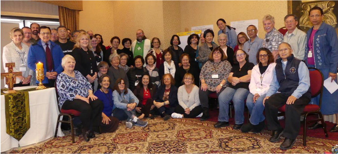
At Chapter 2018 on January 15th, 2018 at Azure hotel in Ontario