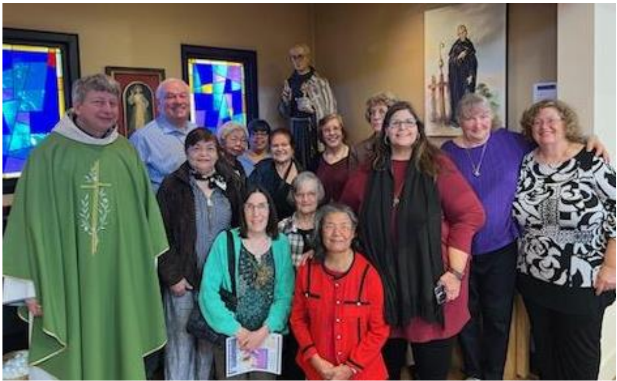
St Maximilian Kolbe Fraternity members with statue of our Patron Saint at Our Lady of Guadalupe Church in Hermosa Beach.