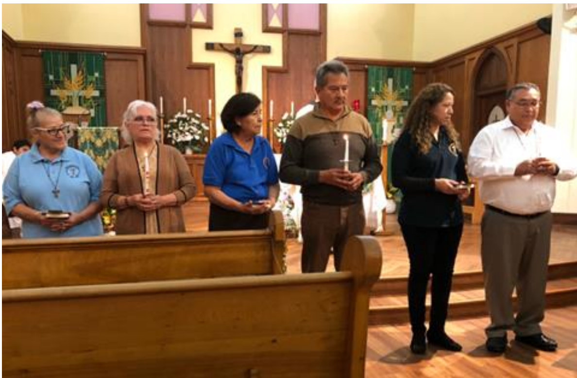
Receiving the Light of Christ