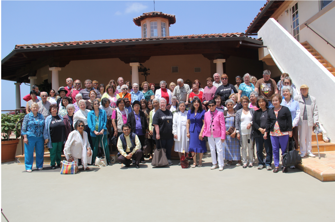
Regional Retreat at Serra Retreat House, May 2013

“Every person who mentions the new Pope to us should be an opportunity for each of us to point out that we follow Christ after the example of Francis of Assisi and explain our Order to them.”