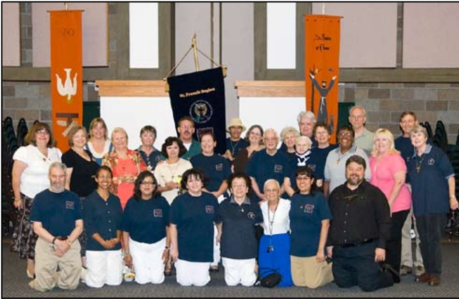
SFO attendees from Immaculata, St. Padre Pio and Holy Spirit Fraternities