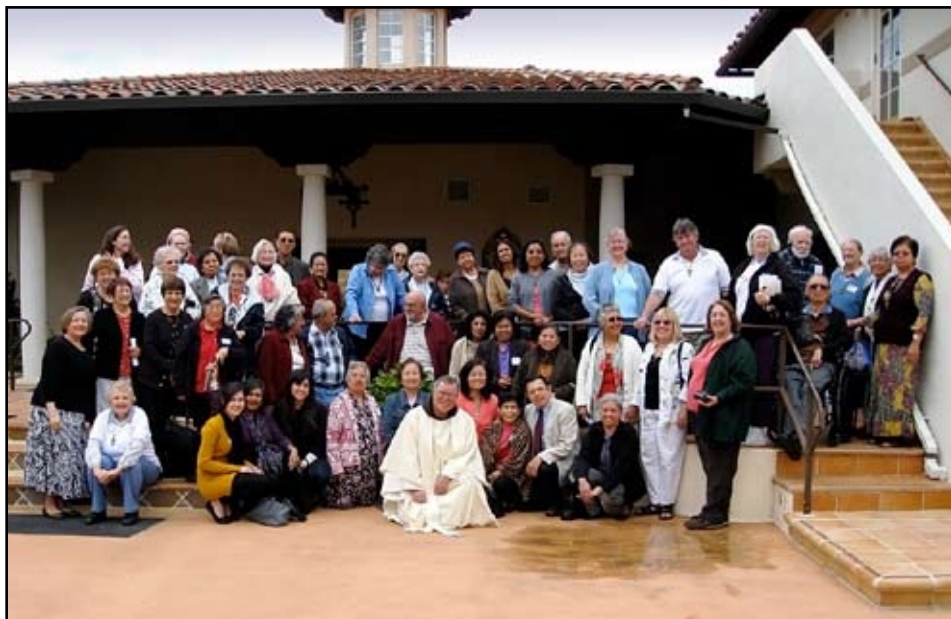
2008 SFO St. Francis Regional Retreat, Serra Retreat Center, Malibu, Page 3