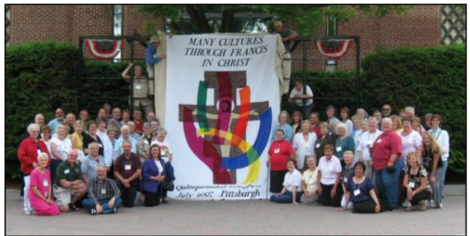
Group Photograph from the Development of Lay Leadership in the Secular Franciscan Order, St. Francis University, Loretto, Pennsylvania.

Connecting with God is the most important aspect of being a servant leader. We must pray from the heart; give our head a rest; don't try to figure