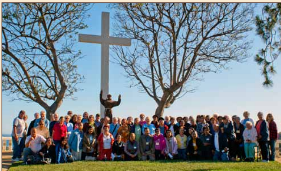
Secular Franciscan May Retreat in Malibu (See Malibu Musings, page 5)