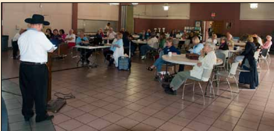
Seminar III in Los Angeles (top) and in Claremont (bottom)