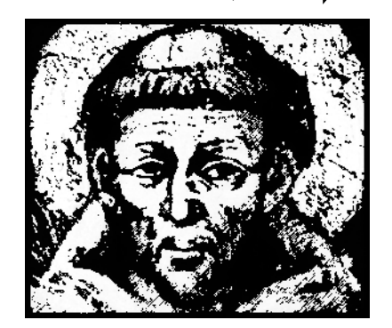
St. Francis Region #52 Secular Franciscan Order Southern California, USA 28275 Rawlings Rd. Hemet, CA 92544